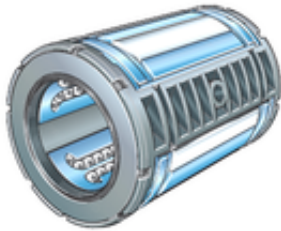
KS40-PP Bearing 2D drawings and 3D CAD models